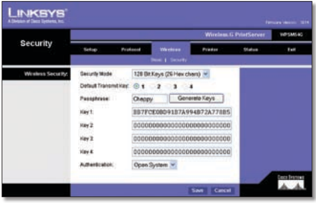
Wireless > Security > WEP

Default Transmit Key Select the Default Transmit Key used by your wireless network. This indicates which WEP key your network uses for WEP encryption.